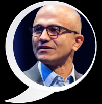
SATYA NADELLA CEO, MICROSOFT

AI could cause real displacement of human jobs.