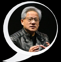
JENSEN HUANG CEO, NVIDIA

You won't lose your job to AI—you'll lose your job to somebody who uses AI.